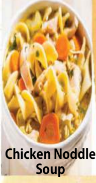
Chicken Noodle Soup