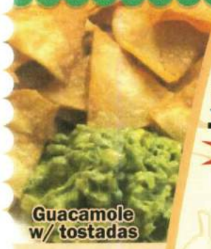
Guacamole w// tostadas