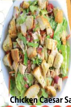
Chicken Caesar Salad